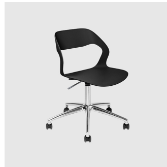
Mixis Air 5-Way Castor TASK CHAIR CRASSEVIG