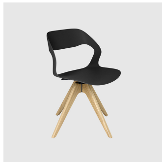
Mixis Air Timber Trestle CHAIR CRASSEVIG