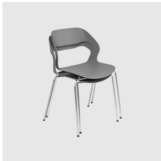
Mixis Air 4-Leg STACKING CHAIR CRASSEVIG