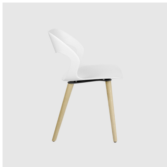
Mixis Air Timber 4-Leg CHAIR CRASSEVIG