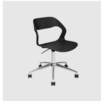
Mixis Air 5-Way Castor TASK CHAIR CRASSEVIG