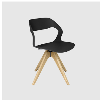
Mixis Air Timber Trestle CHAIR CRASSEVIG