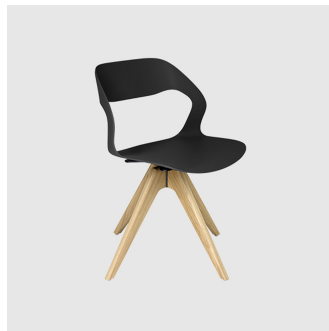
Mixis Air Timber Trestle CHAIR CRASSEVIG