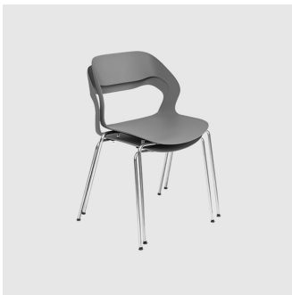
Mixis Air 4-Leg STACKING CHAIR CRASSEVIG