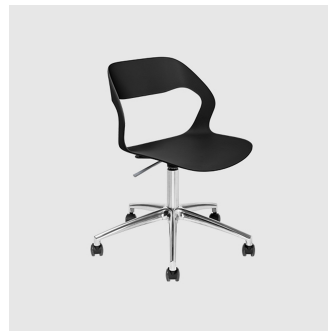
Mixis Air 5-Way Castor TASK CHAIR CRASSEVIG