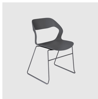
Mixis Air Sled STACKING CHAIR CRASSEVIG