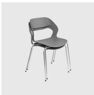
Mixis Air 4-Leg STACKING CHAIR CRASSEVIG