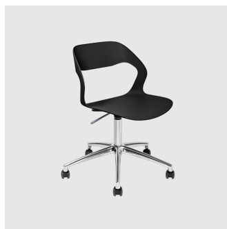
Mixis Air 5-Way Castor TASK CHAIR CRASSEVIG