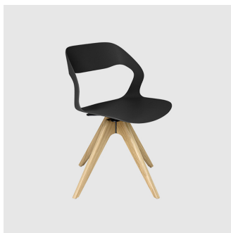
Mixis Air Timber Trestle CHAIR CRASSEVIG