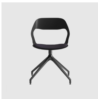
Mixis Air 4-Way Swivel MEETING CHAIR CRASSEVIG