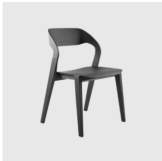
Mixis STACKING CHAIR CRASSEVIG