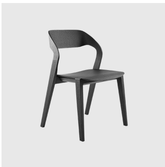
Mixis STACKING CHAIR CRASSEVIG