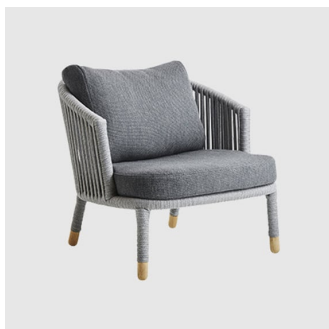
Moments LOUNGE CHAIR CANE-LINE