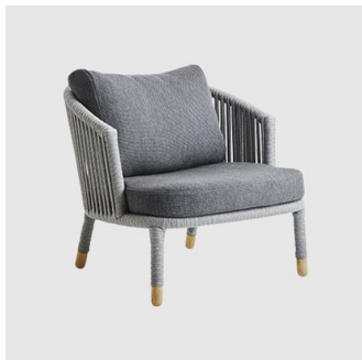
Moments LOUNGE CHAIR CANE-LINE