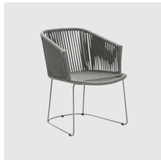
Moments ARMCHAIR CANE-LINE