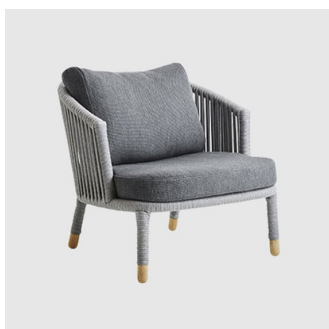
Moments LOUNGE CHAIR CANE-LINE