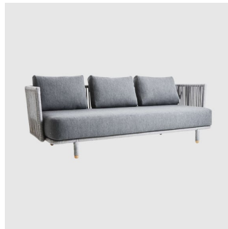
Moments LOUNGE CANE-LINE