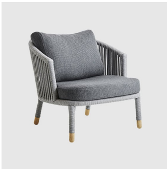
Moments LOUNGE CHAIR CANE-LINE