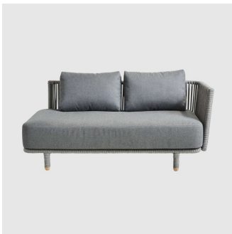
Moments MODULAR LOUNGE CANE-LINE