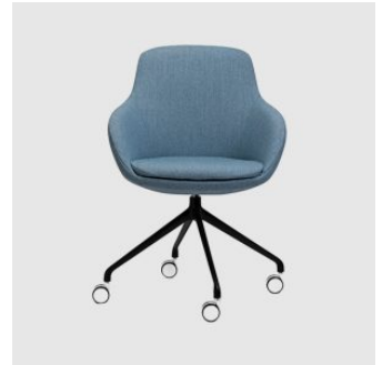
Muse 4-Way Swivel MEETING ARMCHAIR ADVANTA