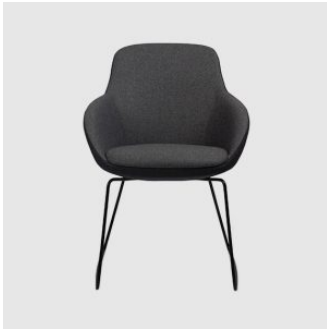
Muse Sled ARMCHAIR ADVANTA