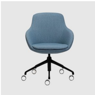
Muse 5-Way on Castors MEETING ARMCHAIR ADVANTA