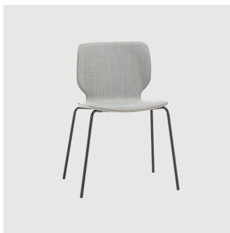
Nim 4-Leg STACKING CHAIR INCLASS