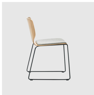
Nim Sled STACKING CHAIR INCLASS