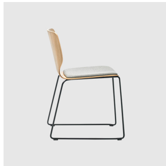
Nim Sled STACKING CHAIR INCLASS