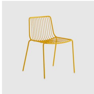
Nolita STACKING CHAIR PEDRALI OUTDOOR