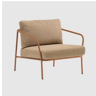
Nolita Relax LOUNGE CHAIR PEDRALI OUTDOOR