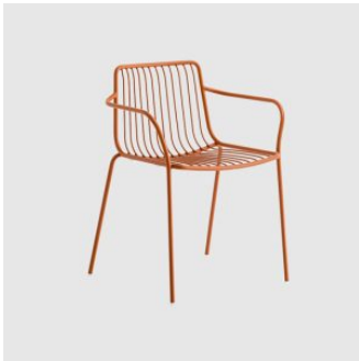
Nolita STACKING ARMCHAIR PEDRALI OUTDOOR