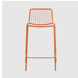
Nolita STOOL PEDRALI OUTDOOR