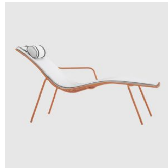
Nolita CHAISE LOUNGE PEDRALI OUTDOOR