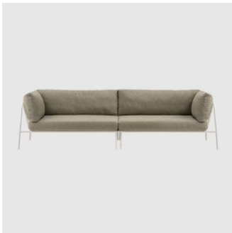
Nolita MODULAR LOUNGE PEDRALI OUTDOOR