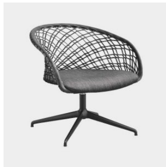
P47 4-Way Swivel LOUNGE CHAIR MIDJ