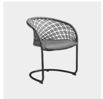
P47 Cantilever ARMCHAIR MIDJ