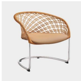
P47 Cantilever LOUNGE CHAIR MIDJ