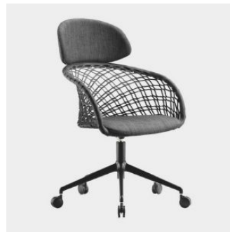
P47 5-Way Castor TASK ARMCHAIR MIDJ