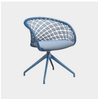
P47 4-Way Swivel MEETING ARMCHAIR MIDJ