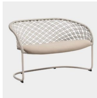
P47 Cantilever LOUNGE MIDJ