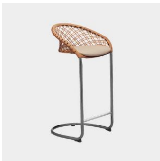
P47 Cantilever STOOL MIDJ