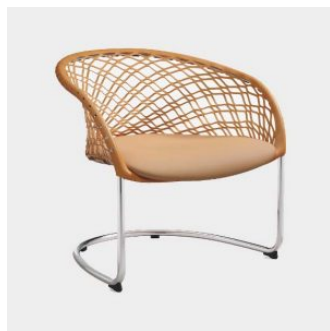
P47 Cantilever LOUNGE CHAIR MIDJ