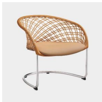
P47 Cantilever LOUNGE CHAIR MIDJ