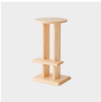
Parallel High STOOL DOWEL JONES