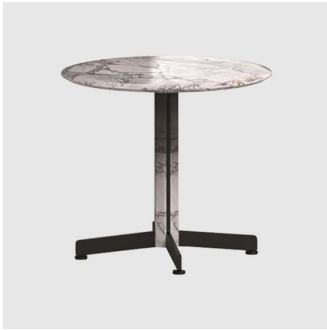
Piana SIDE/COFFEE TABLE ARRMET