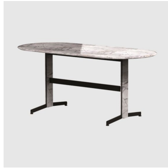
Piana MEETING/DINING TABLE ARRMET