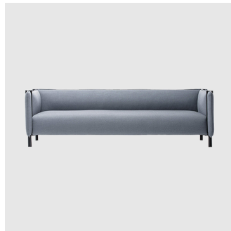
Pinch LOUNGE LACIVIDINA