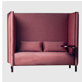
Pinch PRIVACY POD LACIVIDINA