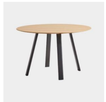
Plania Round MEETING/DINING TABLE INCLASS