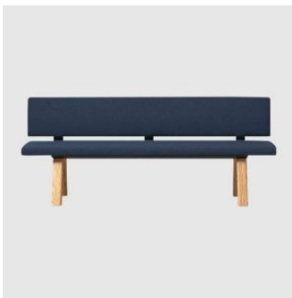
Plania BENCH INCLASS