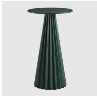
Plissé COUNTER/BAR HEIGHT TABLE MIDJ