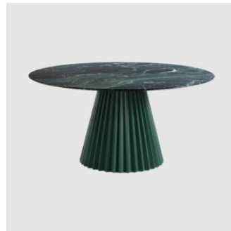
Plissé MEETING/DINING TABLE MIDJ