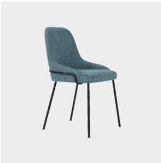
Queen 10 Metal 4-Leg