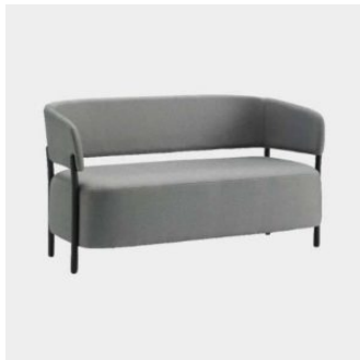
RC Metal LOUNGE BLASCO&VILA