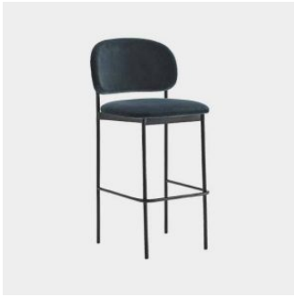
RC Metal STOOL BLASCO&VILA