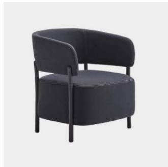
RC Metal LOUNGE CHAIR BLASCO&VILA