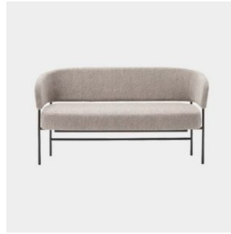
RC Metal Easy LOUNGE BLASCO&VILA