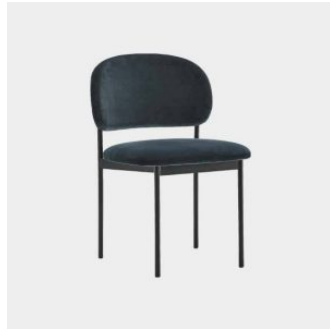
RC Metal CHAIR BLASCO&VILA