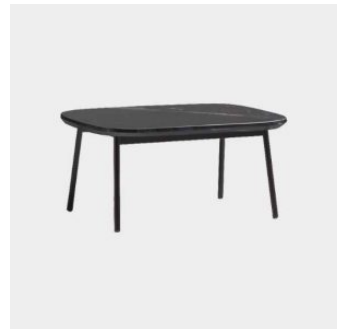
RC Metal SIDE/COFFEE TABLE BLASCO&VILA