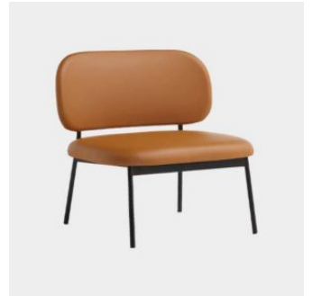
RC Metal Lobby LOUNGE CHAIR BLASCO&VILA