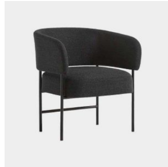
RC Metal Easy LOUNGE CHAIR BLASCO&VILA