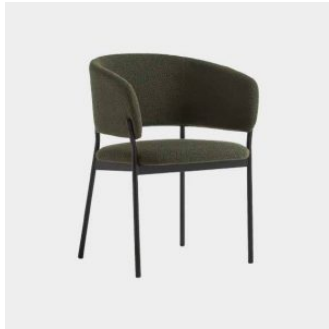
RC Metal ARMCHAIR BLASCO&VILA