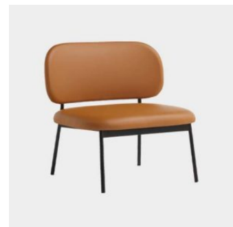
RC Metal Lobby LOUNGE CHAIR BLASCO&VILA