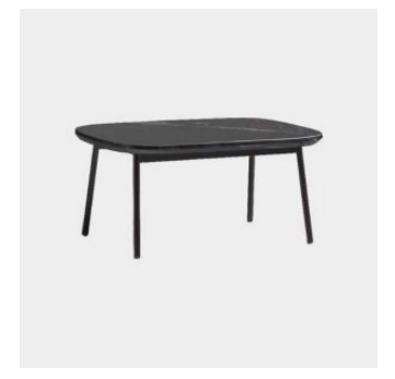
RC Metal SIDE/COFFEE TABLE BLASCO&VILA