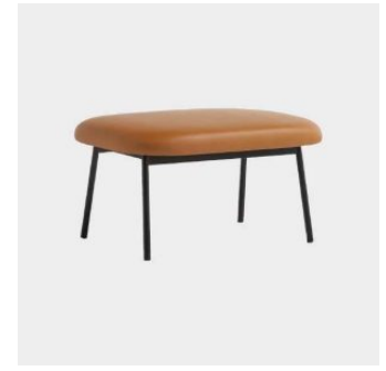
RC Metal OTTOMAN BLASCO&VILA