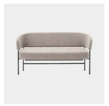
RC Metal Easy LOUNGE BLASCO&VILA