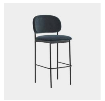
RC Metal STOOL BLASCO&VILA