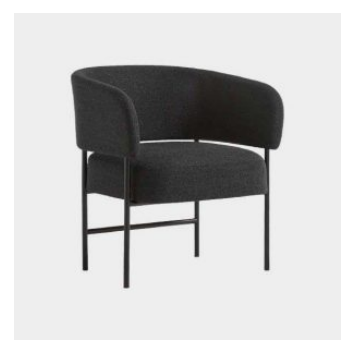
RC Metal Easy LOUNGE CHAIR BLASCO&VILA