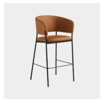
RC Metal with Arms STOOL BLASCO&VILA