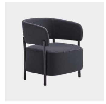
RC Metal LOUNGE CHAIR BLASCO&VILA