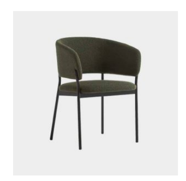
RC Metal ARMCHAIR BLASCO&VILA