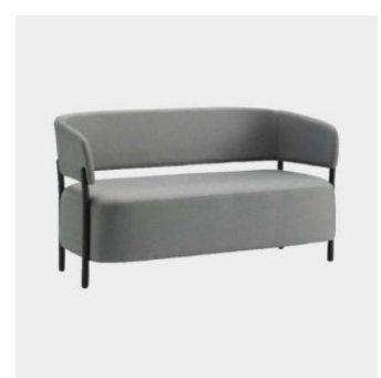
RC Metal LOUNGE BLASCO&VILA