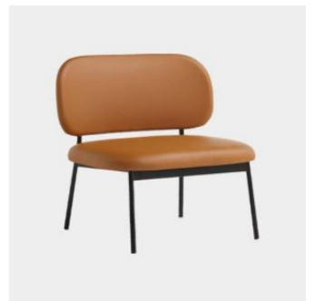
RC Metal Lobby LOUNGE CHAIR BLASCO&VILA