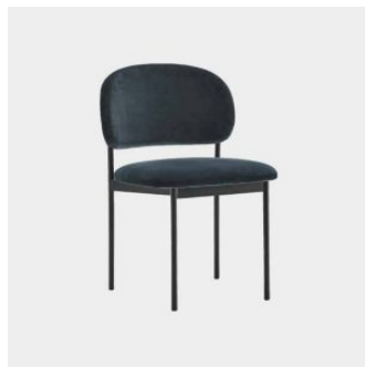
RC Metal CHAIR BLASCO&VILA