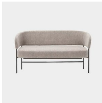
RC Metal Easy LOUNGE BLASCO&VILA