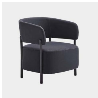
RC Metal LOUNGE CHAIR BLASCO&VILA