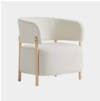
RC Wood LOUNGE CHAIR BLASCO&VILA