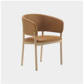
RC Wood ARMCHAIR BLASCO&VILA