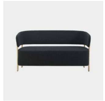
RC Wood LOUNGE BLASCO&VILA