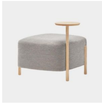
RC Wood OTTOMAN BLASCO&VILA