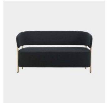
RC Wood LOUNGE BLASCO&VILA