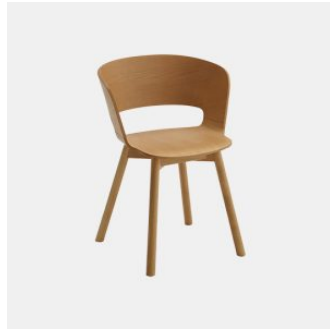
Ribbon Timber ARMCHAIR CANTARUTTI