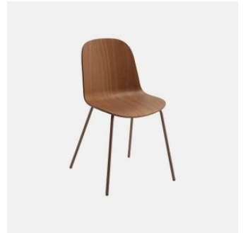
Ribbon Metal CHAIR CANTARUTTI