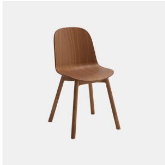
Ribbon Timber CHAIR CANTARUTTI