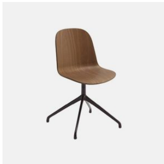
Ribbon Metal 4-Way Swivel MEETING CHAIR CANTARUTTI