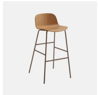
Ribbon Metal 4-Way Swivel STOOL CANTARUTTI