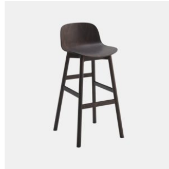
Ribbon Timber STOOL CANTARUTTI