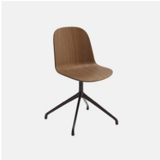
Ribbon Metal 4-Way Swivel MEETING CHAIR CANTARUTTI