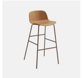
Ribbon Metal 4-Way Swivel STOOL CANTARUTTI