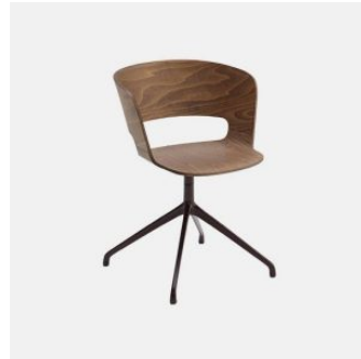
Ribbon Metal 4-Way Swivel MEETING ARMCHAIR CANTARUTTI