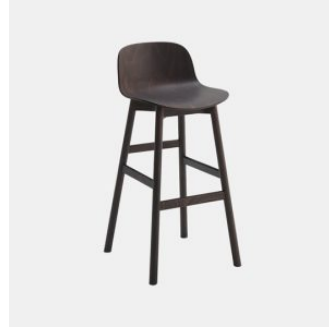
Ribbon Timber STOOL CANTARUTTI