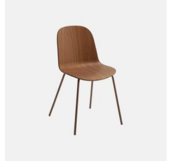
Ribbon Metal CHAIR CANTARUTTI