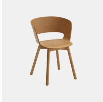
Ribbon Timber ARMCHAIR CANTARUTTI