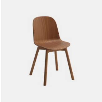
Ribbon Timber CHAIR CANTARUTTI