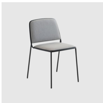
Ring CHAIR ET AL.