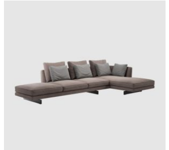
Savoy MODULAR LOUNGE BENSEN