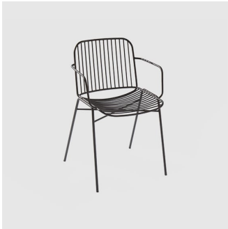
Shade ARMCHAIR ET AL.