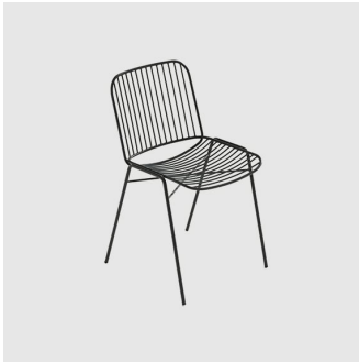
Shade CHAIR ET AL.