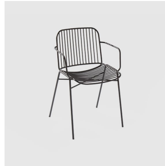
Shade ARMCHAIR ET AL.