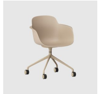
Sicla 4-Way Castor MEETING ARMCHAIR INFINITI