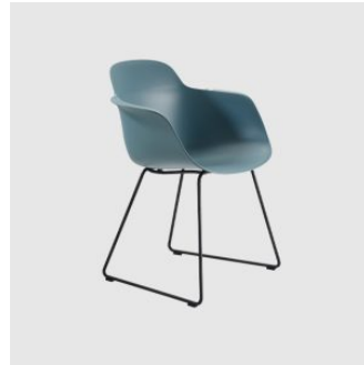
Sicla Sled MEETING ARMCHAIR INFINITI