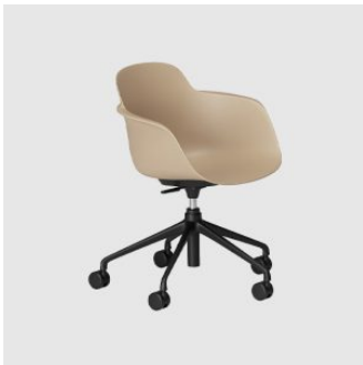
Sicla 5-Way Castor TASK ARMCHAIR INFINITI