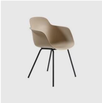
Sicla 4-Leg ARMCHAIR INFINITI