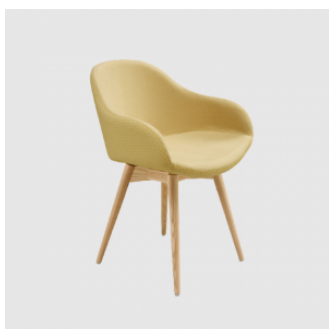
Sonny PB Timber ARMCHAIR MIDJ