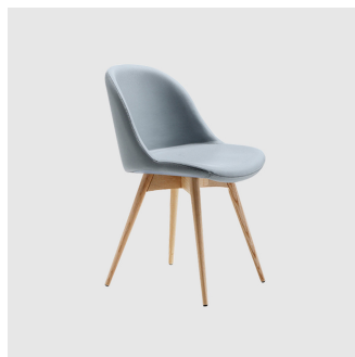
Sonny S Timber CHAIR MIDJ