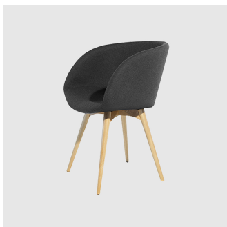
Sonny P Timber ARMCHAIR MIDJ