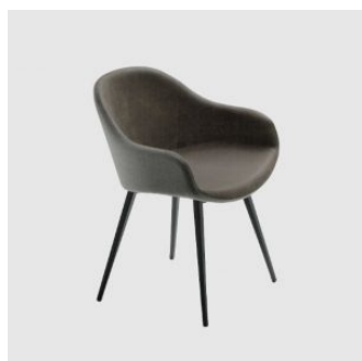
Sonny PB ARMCHAIR MIDJ