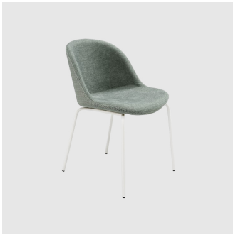
Sonny S CHAIR MIDJ