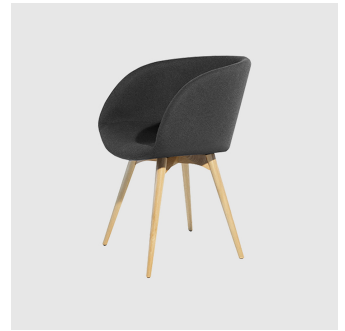
Sonny P Timber ARMCHAIR MIDJ