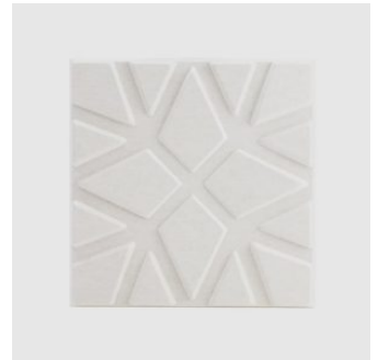
Soundwave Geo ACOUSTIC PANEL OFFECCT - FLOKK