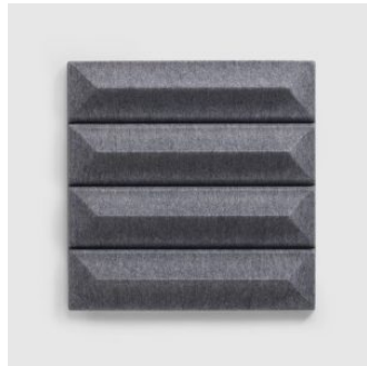
Soundwave Ceramic ACOUSTIC PANEL OFFECCT - FLOKK