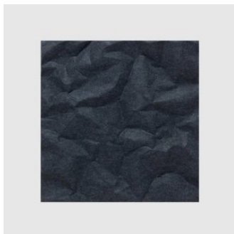
Soundwave Scrunch ACOUSTIC PANEL OFFECCT - FLOKK