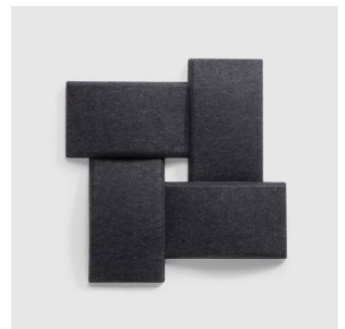
Soundwave Wicker ACOUSTIC PANEL OFFECCT - FLOKK