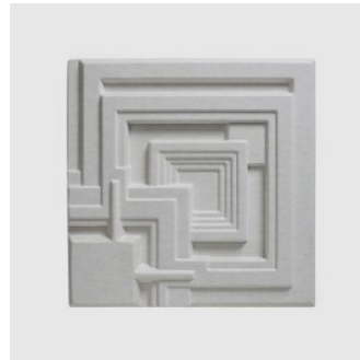
Soundwave Ennis ACOUSTIC PANEL OFFECCT - FLOKK