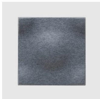
Soundwave Swell ACOUSTIC PANEL OFFECCT - FLOKK