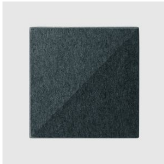
Soundwave Bella ACOUSTIC PANEL OFFECCT - FLOKK