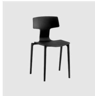
Split Plastic 4-Leg STACKING CHAIR COLOS