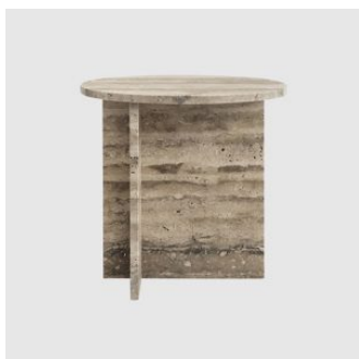
There Oval SIDE/COFFEE TABLE SIDES