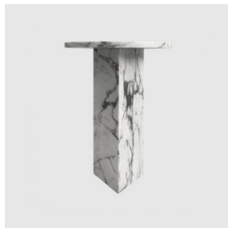
Stand Three Ways SIDE/COFFEE TABLE SIDES