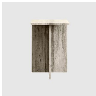
Stay There SIDE/COFFEE TABLE SIDES