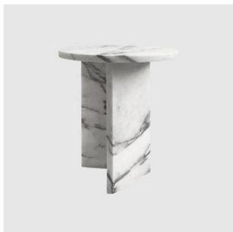
Stand Alone SIDE/COFFEE TABLE SIDES