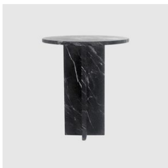
There Round SIDE/COFFEE TABLE SIDES