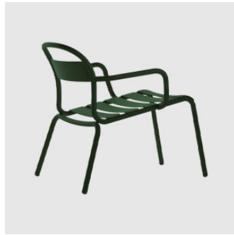
Stecca LOUNGE CHAIR COLOS