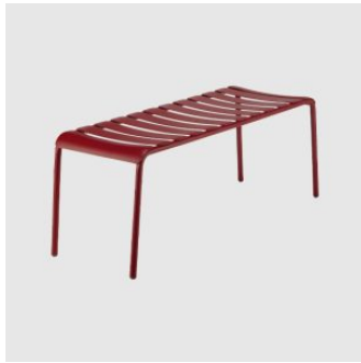
Stecca BENCH COLOS