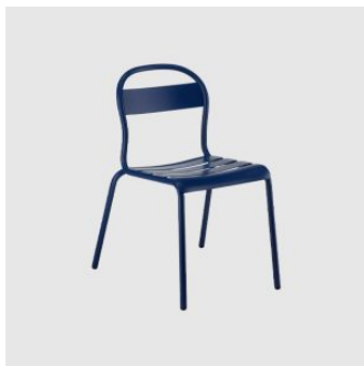
Stecca STACKING CHAIR COLOS