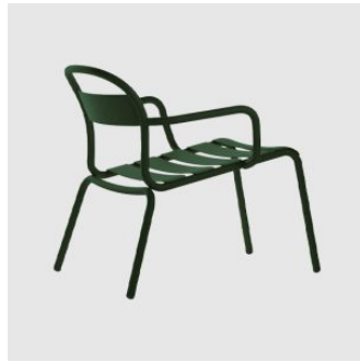
Stecca LOUNGE CHAIR COLOS