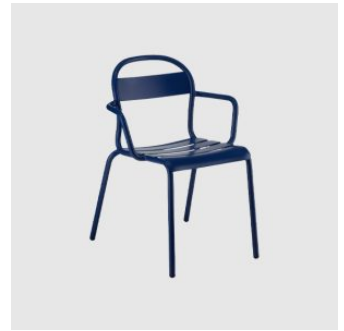
Stecca STACKING ARMCHAIR COLOS