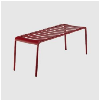
Stecca BENCH COLOS