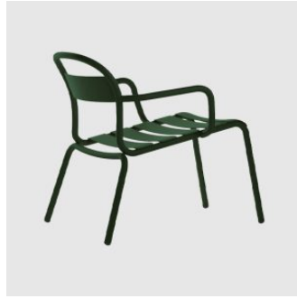
Stecca LOUNGE CHAIR COLOS