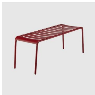
Stecca BENCH COLOS