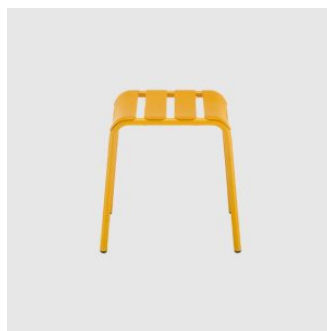
Stecca Low STOOL COLOS