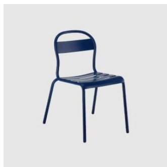
Stecca STACKING CHAIR COLOS