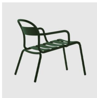
Stecca LOUNGE CHAIR COLOS