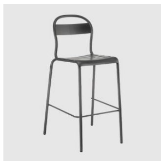
Stecca STOOL COLOS