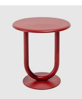
Strong CAFé/DINING TABLE DESALTO