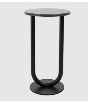
Strong COUNTER/BAR HEIGHT TABLE DESALTO