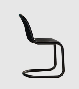
Strong CHAIR DESALTO