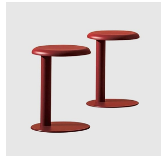
Strong Low STOOL DESALTO