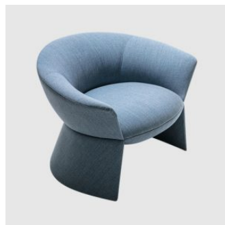
Swale Low Back Upholstered LOUNGE CHAIR LACIVIDINA