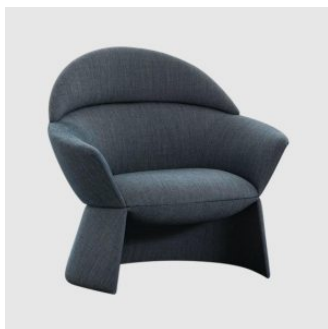
Swale High Back Upholstered LOUNGE CHAIR LACIVIDINA