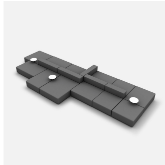
Takimi MODULAR LOUNGE LACIVIDINA