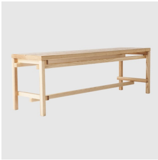
Tim Ber Bench BENCH DOWEL JONES