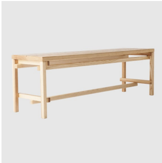
Tim Ber Bench BENCH DOWEL JONES